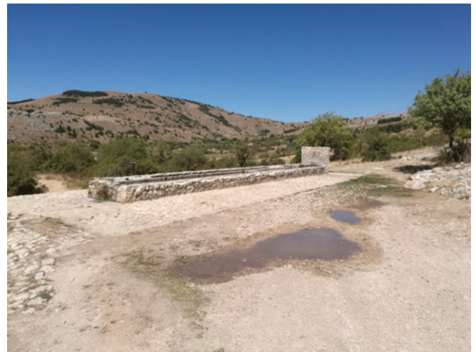
Figure 4. Drinking trough in which adults and larvae of Lissotriton italicus , Bufo bufo , Hyla intermedia and Pelophylax bergeri / P. kl. hispanicus were observed

The most commonly observed reproductive habitats by the three newt species ( L. italicus , L. vulgaris , T. carnifex ) and B. pachypus were drinking troughs and small ponds located in small valleys or pastures along the border of dry grassland and woods (Fig. 4). For reproduction Salamandra salamandra , Salamandrina perspicillata , S. terdigitata and