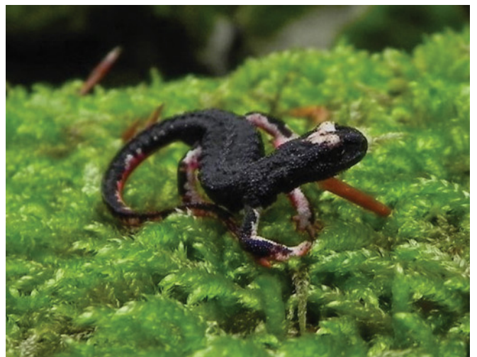
Figure 3. Adult Salamandrina perspicillata from the Molise side of the Matese Massif

side (province of Benevento, Romano et al., 2009)(Fig. S3). Extremely interesting are the populations of S. perspicillata occurring in some localities of the Molise side (see Romano et al., 2009 for the list of localities), as they are characterised by a genome in which alleles of S. terdigitata are present (Fig. 3). This could be the evidence of past hybridisation and introgression between the two species (Hauswaldt et al., 2011; Mattoccia et al., 2011). However, it should be noted that the taxonomic distinction between S. perspicillata and S. terdigitata is based on mitochondrial (Mattoccia et al., 2005; Nascetti et al., 2005) and nuclear analyses (Nascetti et al., 2005), while no morphological traits allow a clear and easy distinction between the two species in the field (Angelini et al., 2007). Although some small and hardly noticeable differences in size and coloration could allow a tentative distinction between adults of the two species (Romano et al., 2009), neither young individuals nor larvae can be identified exclusively on the basis of morphological characters. Since our observations were based on field investigations it did not allow the unambiguous taxonomic attribution to one or the other species. In the present contribution the original data